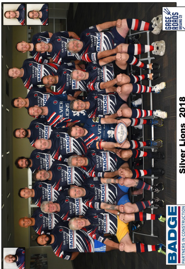
Silver Lions 2018