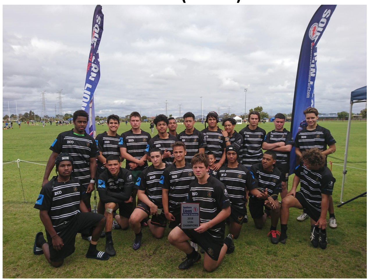
U16 CUP FINAL Perth Bayswater (Black) Rugby Club 31 Perth Bayswater (White) Rugby Club 19